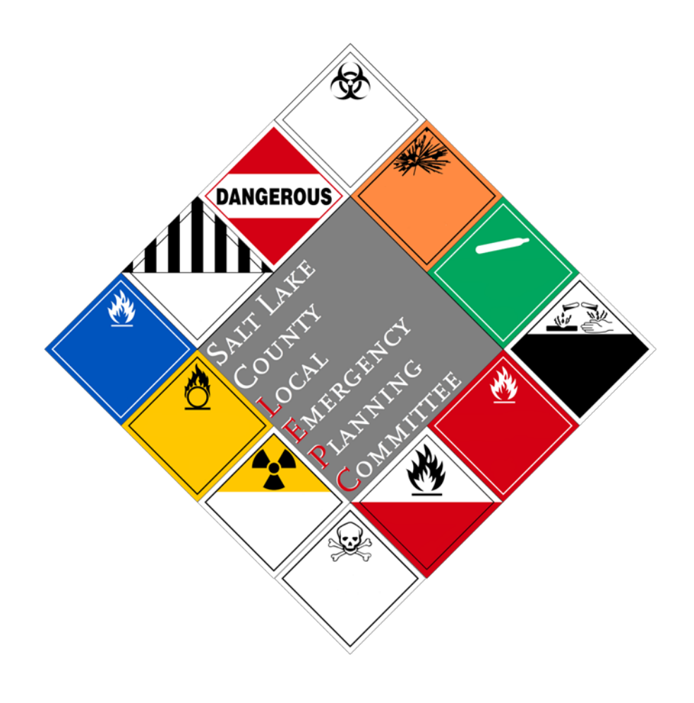
Hazardous Materials Emergency Response Plan 2023