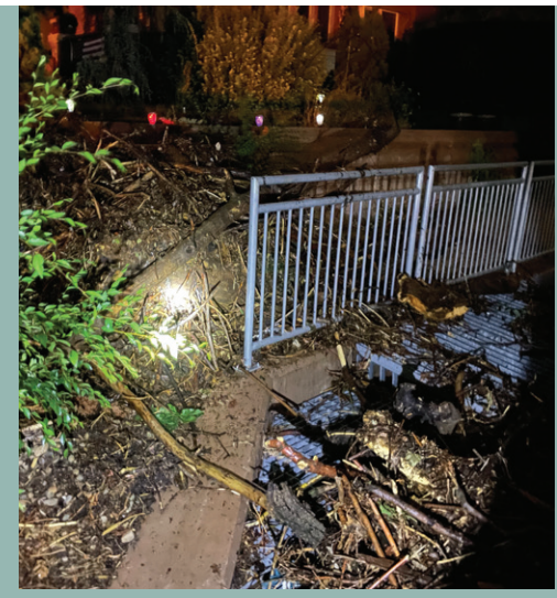
Debris from the severe rainstrom event in August, 2021.