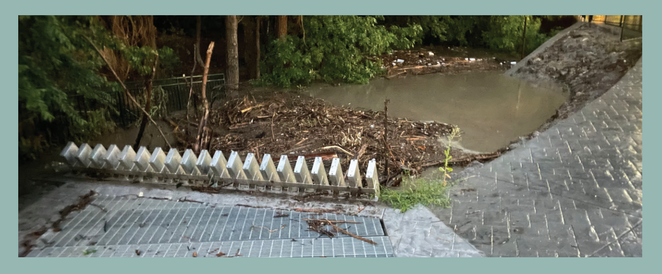
Flooding in Salt Lake County following the severe rainstorm event in August.