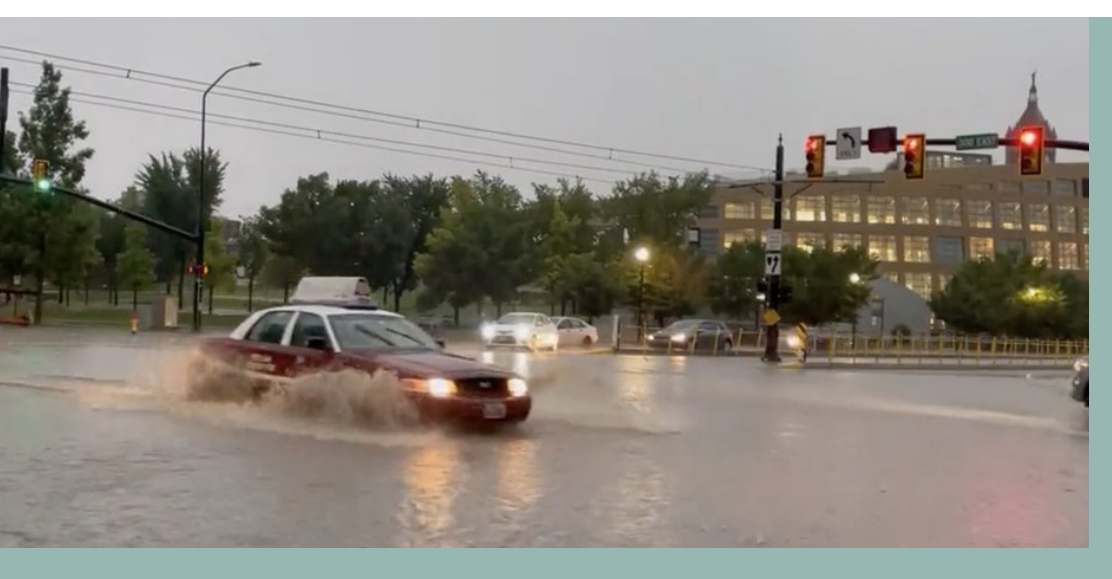
Severe rainstorm causes flooding in downtown Salt Lake City.