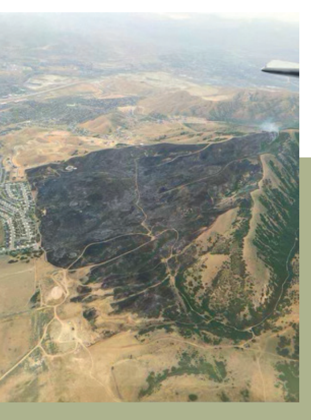
Above and right: Parleys Canyon Fire August 14, 2021