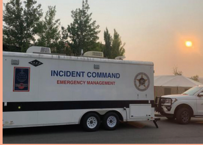
Incident command post for the EMAC deployment for the wildfires in California.