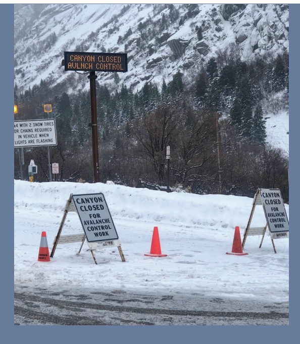
Little Cottonwood Canyon closed for avalanche mitigation.