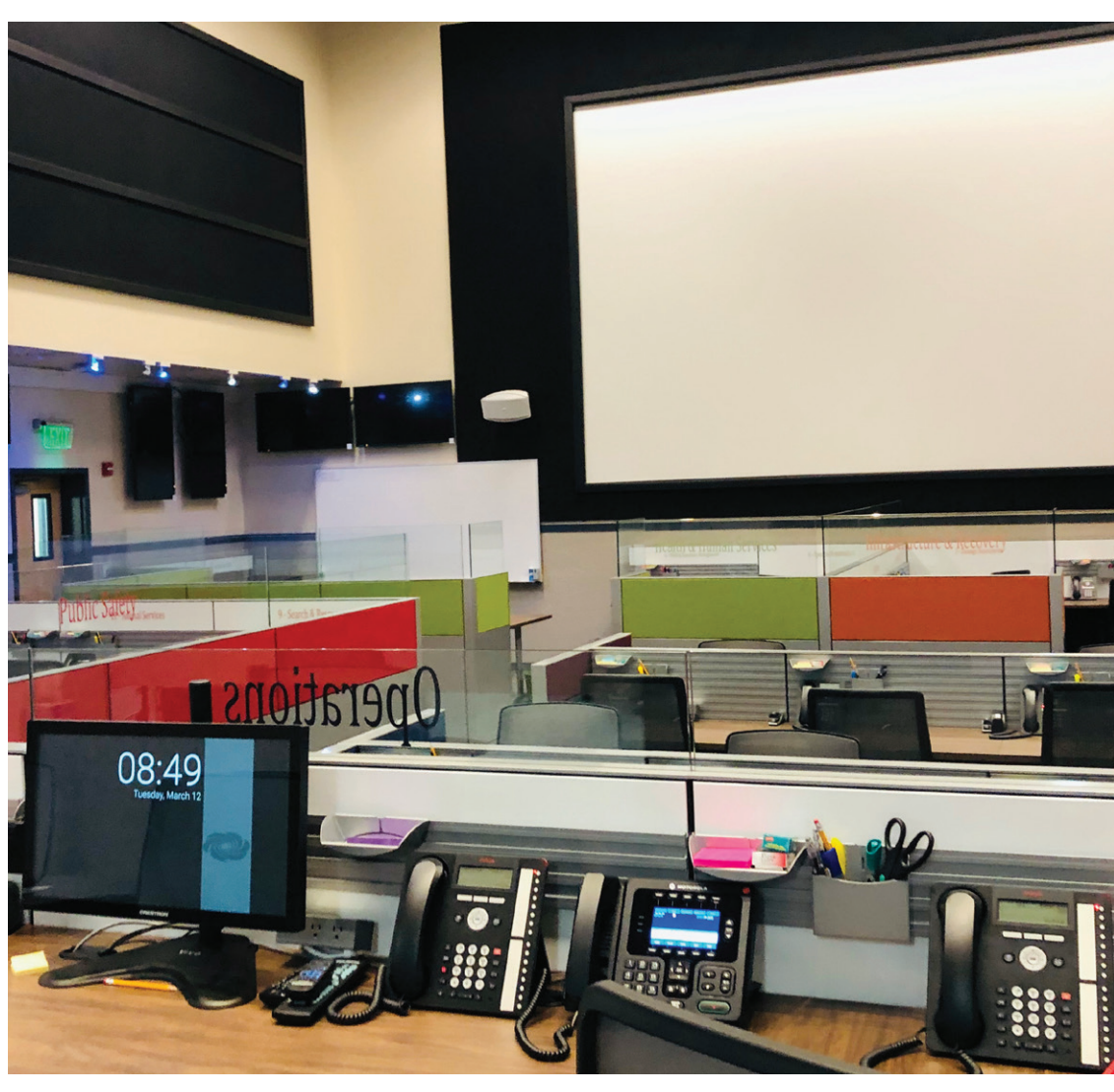
Inside the Emergency Coordination Center, Operations Room.

The ECC/EOC responds to an emergency or an incident by activating their Emergency Support Functions (ESFs): ESFs provide the structure for coordinating interagency support for a response to an incident. They are mechanisms for grouping functions most frequently used to provide federal support to states and federal-to-federal support, both for declared disasters and emergencies under the Stafford Act and for non-Stafford Act incidents. There are currently 15 Emergency Support Functions.