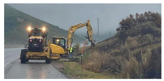
Flooding mitigation following the Parleys Canyon fire in August, 2021.