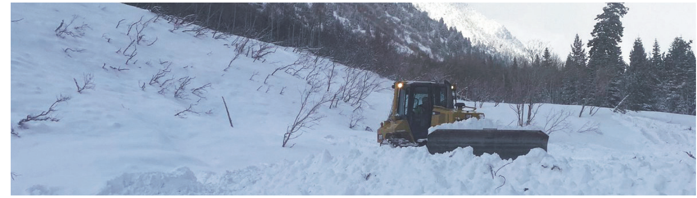
Canyon crews working on avalanche mitigation.