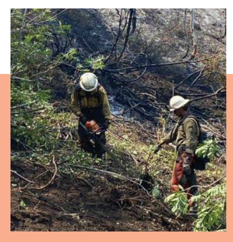
Wildfire mitigation in California.